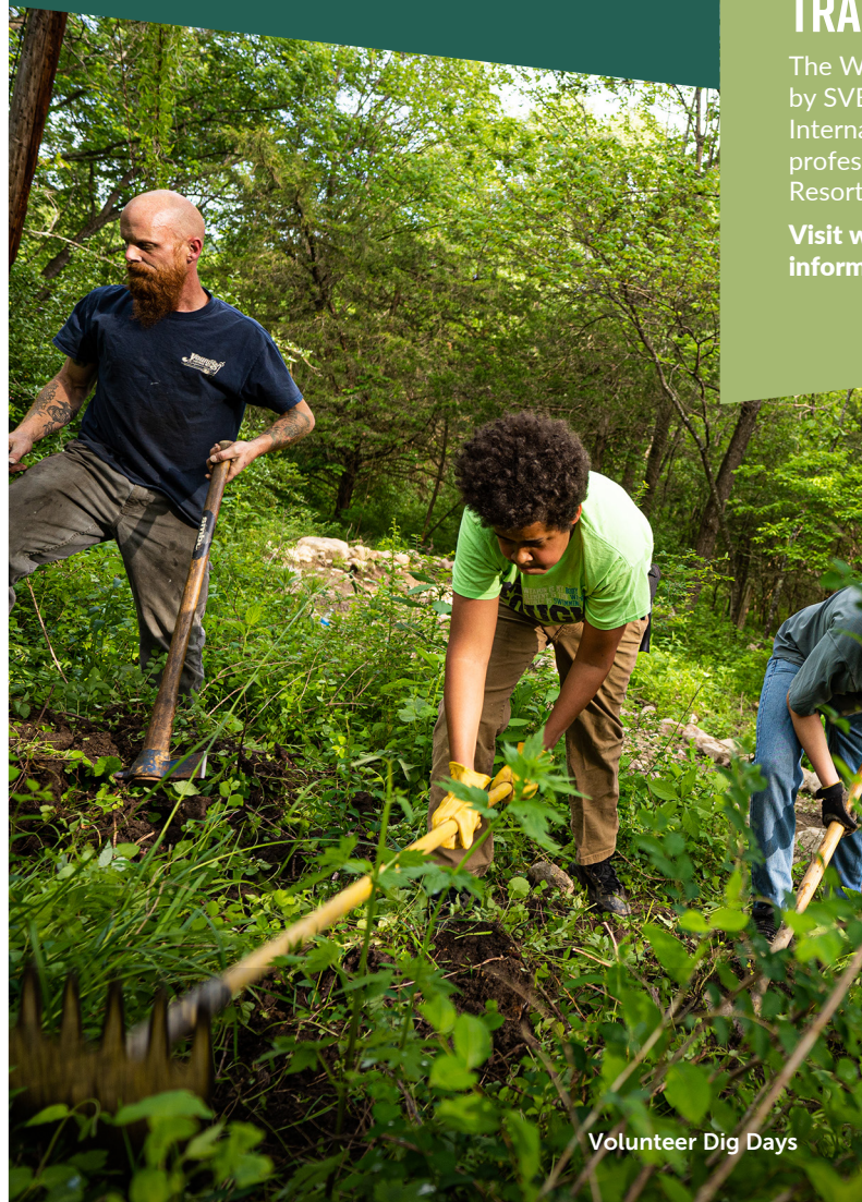
Volunteer Dig Days