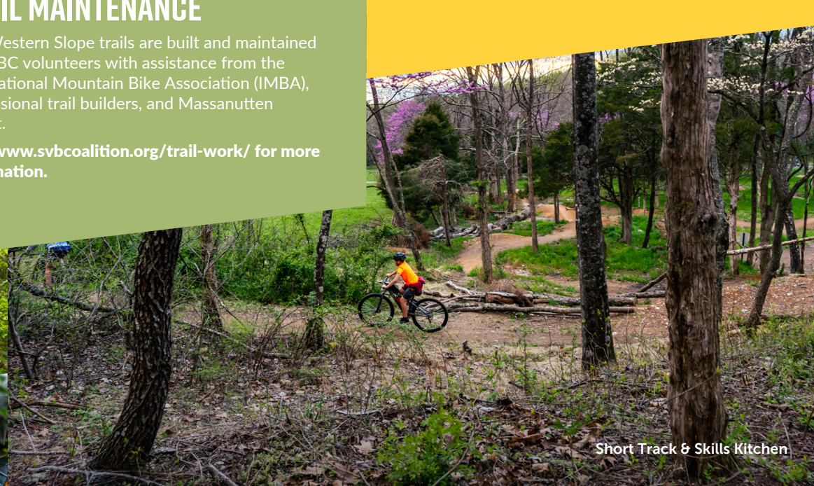
Short Track & Skills Kitchen