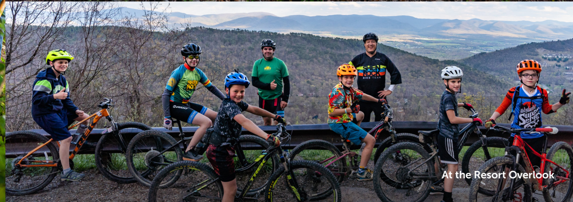
At the Resort Overlook